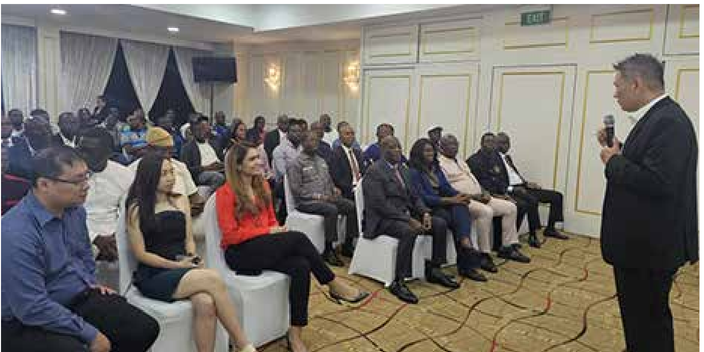
An official of Enterprise Singapore addressing participants at the meeting