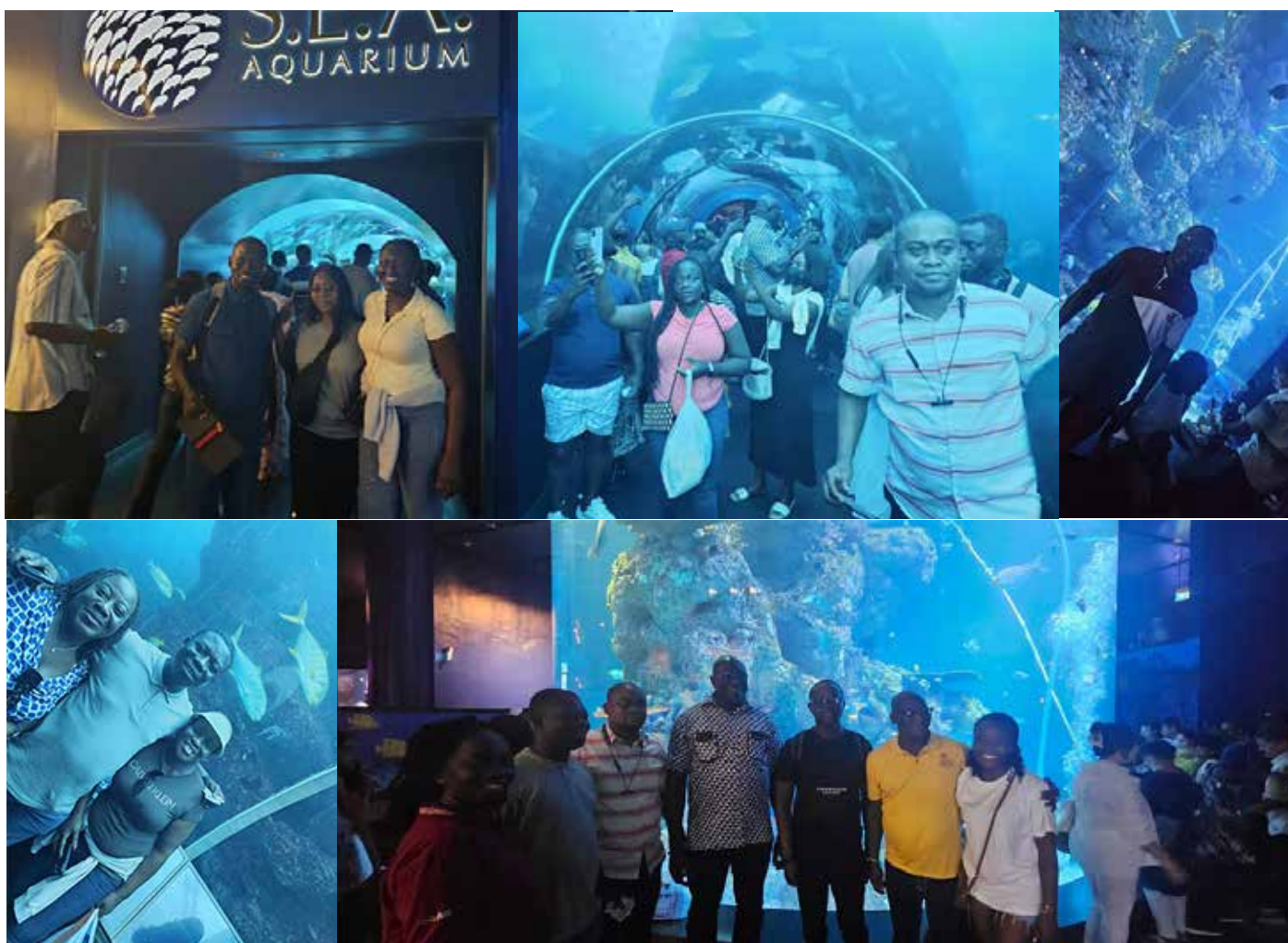
Fun moments at the S.E.A. Aquarium

It was so therapeutic to experience the S.E.A. Aquarium, one of the world's largest aquariums, home to more than 100,000 marine animals representing 1,000 species across more than 40 diverse habitats. The vast array of aquatic life is complemented by interactive programmes, up-close animal encounters, and immersive learning journeys to inspire visitors to protect the world's oceans.