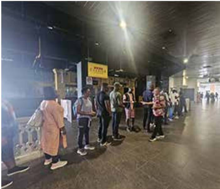
Participants inside the Genting Highlands