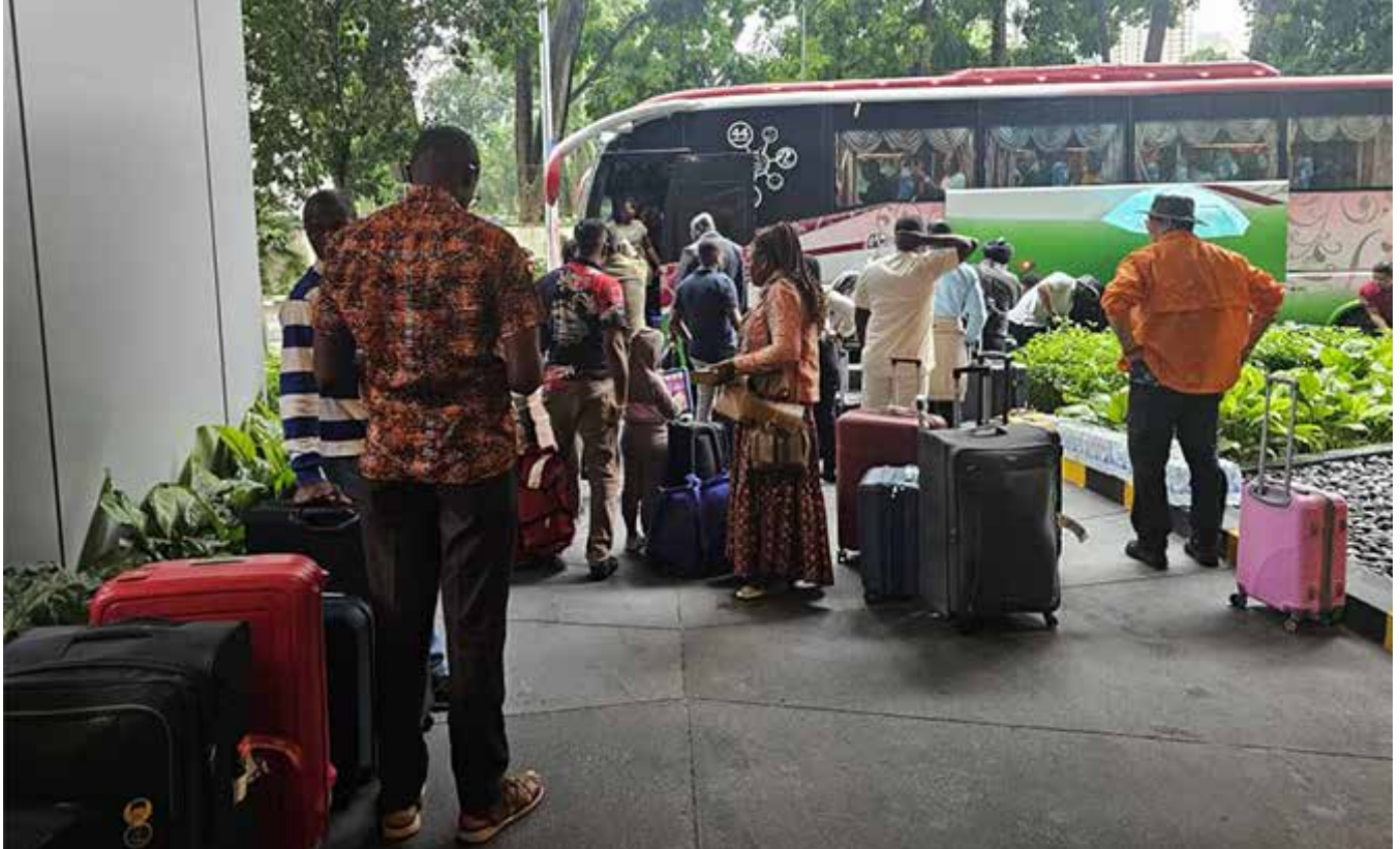
Participants preparing to board their buses for Singapore

Enroute to Singapore was another experience for participants which took over 8 hours plus another hour or 2 of immigration check in. Though tiring, we were exposed to the strict immigration checks at Singapore but we picked some lessons from the Singapore Immigration and Checkpoints Authority (ICA) about the importance of being innovative on security measures as a country. In fact, not even the similarities in our names (ICA and ICAG) would make them spare us. I must add that the beautiful people, tourist sites and sumptuous meals made it worth the wait.