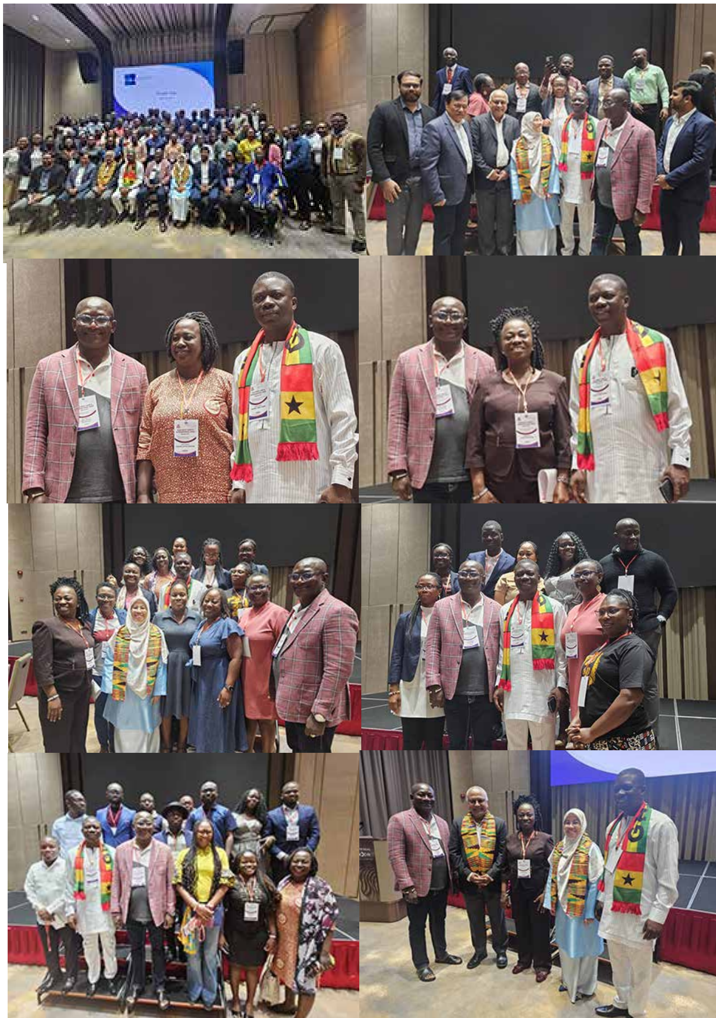
Group photographs after the session