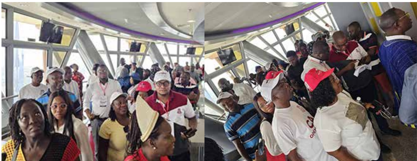
Participants entering the KL Tower