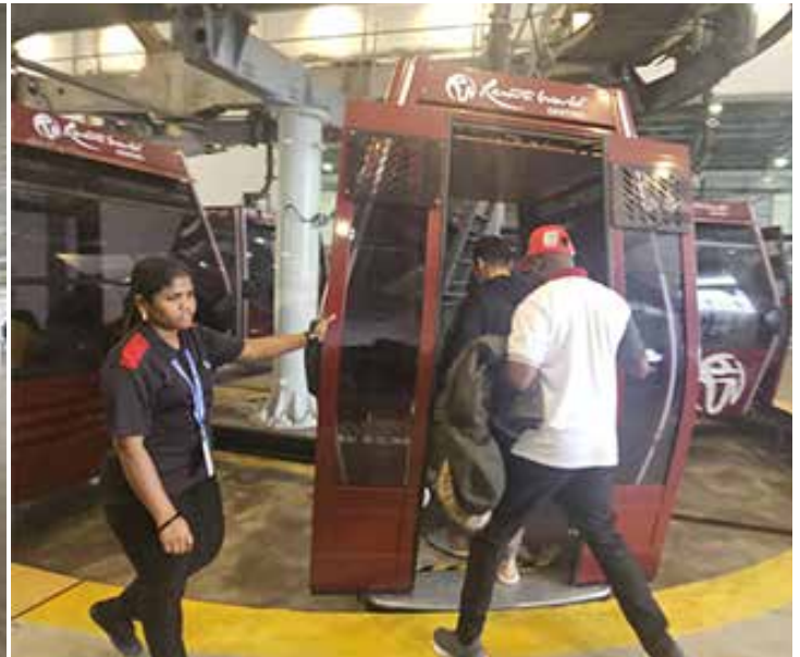
Participants boarding the cable car