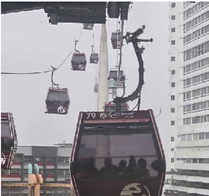
Participants flying in the cable cars