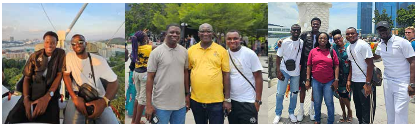
Group photographs at the Singapore Time Capsule