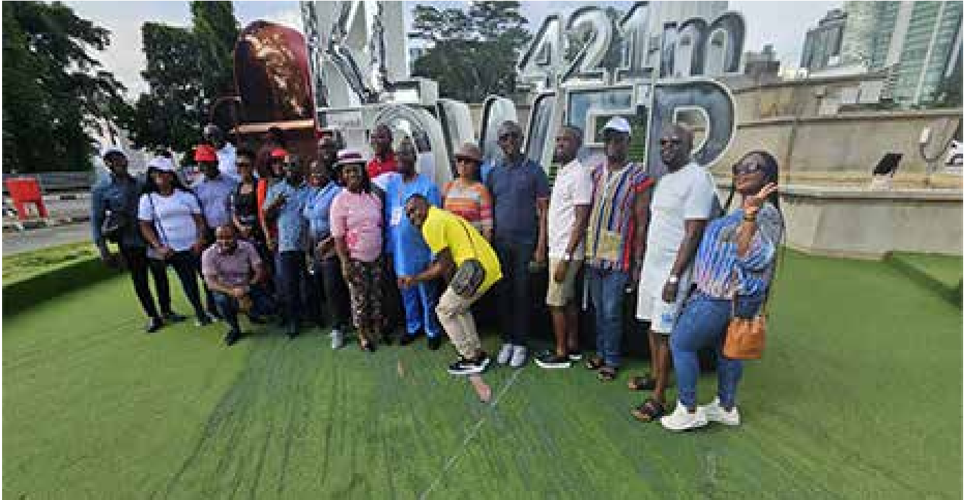
A group photograph at KL Tower

Participants toured beautiful cities in Malaysia. The world's seventh-tallest tower, the Kuala Lumpur Tower, a 6-storey, 421-metre-tall telecommunication tower popularly known as the KL Tower, was an iconic site to behold.