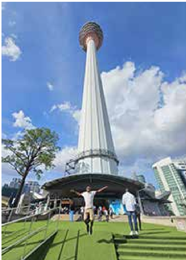
The fun moment for a participant in front of KL Tower