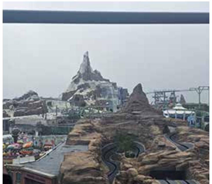
Beautiful bird's eye view from the cable car