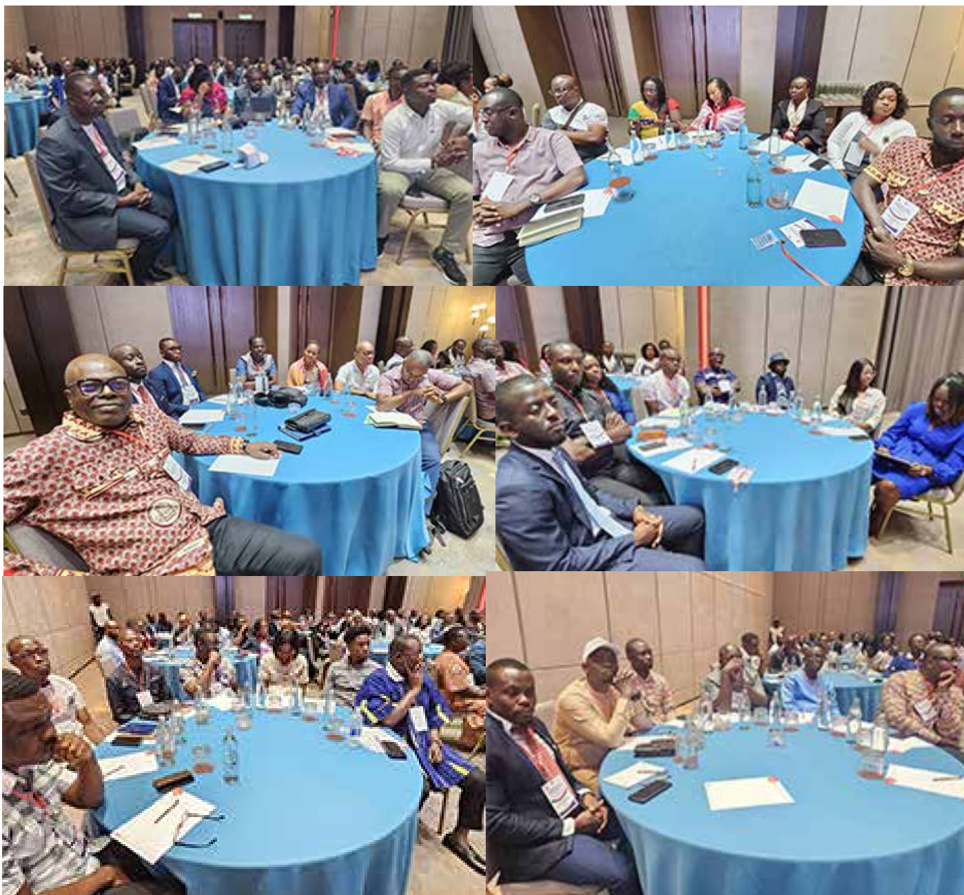
A cross-section of Participants at Day 1 Boot Camp