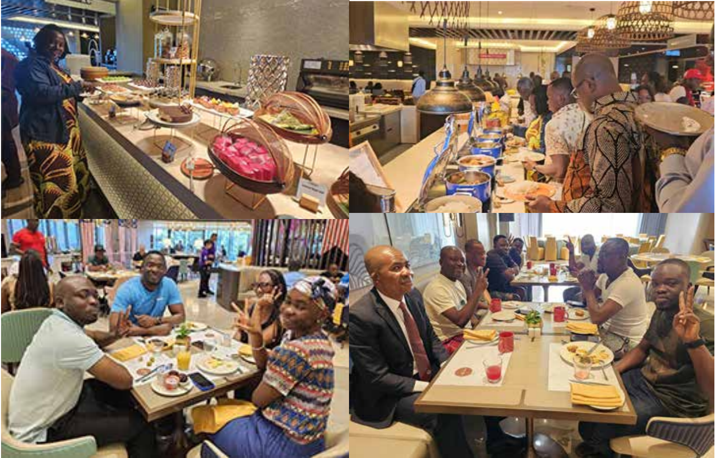
Some participants having meals together

Having wonderful and meals together at different locations, shopping and interacting alongside was indeed a great bonding moment. Participants were spoilt for choice as variety of meals ranging from Malaysian, Indian, and Chinese were served. Though some struggled to try these meals which had no Ghanaian appeal.....hahahaaa, it was also part of the unforgettable experience they would share with their families and friends back home.