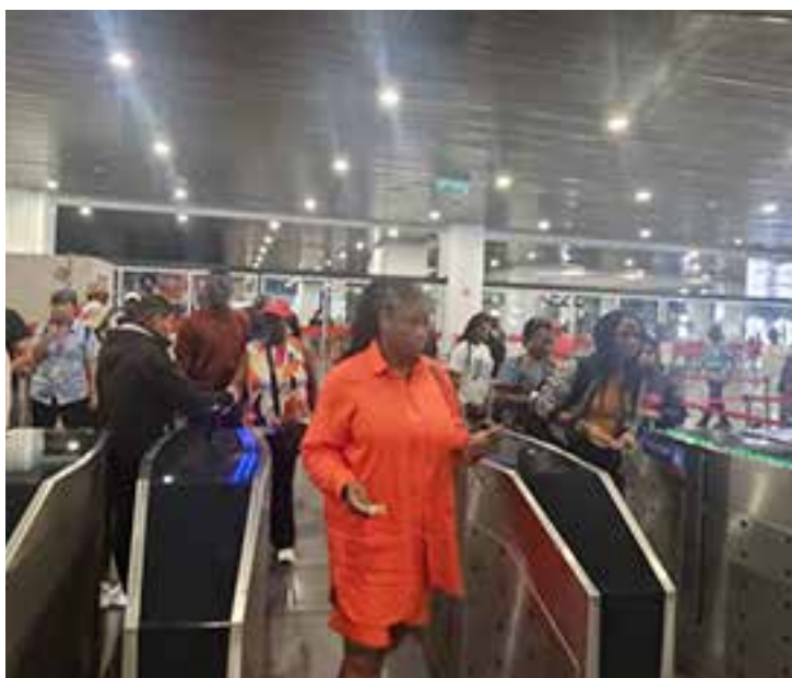
Participants entering the Genting highhighlands

For an unforgettable experience, participants were taken to Malaysia's Las Vegas, the Genting Highlands. With an elevation of almost 2,000 m and a temperature averaging 24°, the weather was perfect for relaxation.