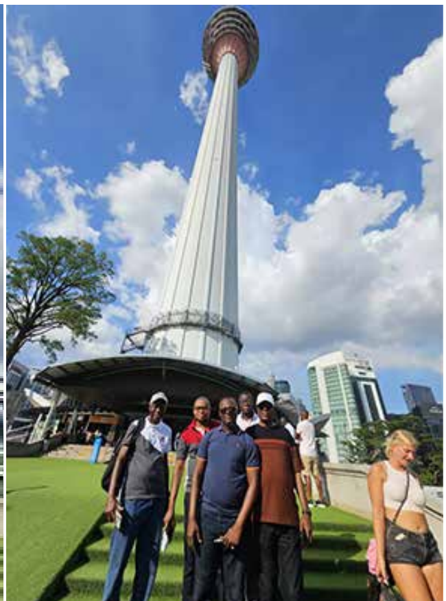
A group photograph in front of KL Tower