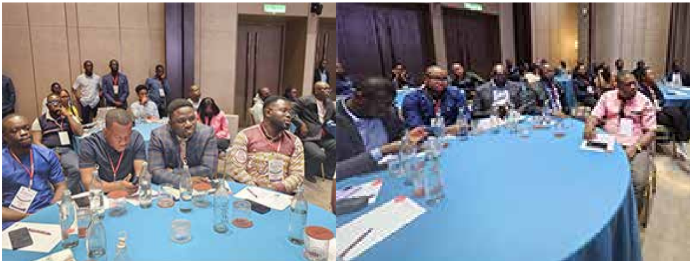
A cross-section of participants