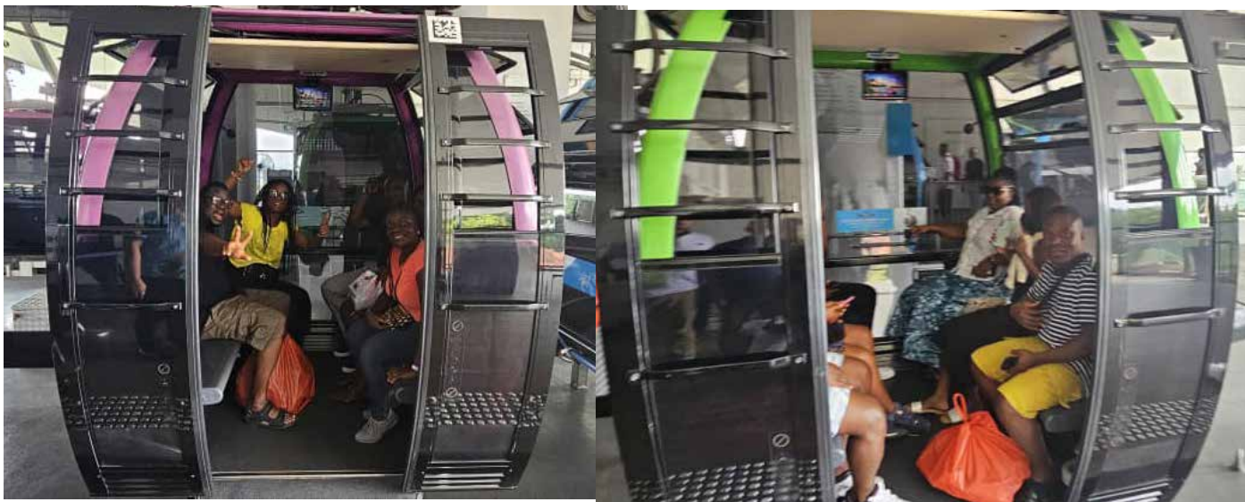
Cross-sections of participants in the cable cars about to take a ride

Participants got all the stunning views aboard the Singapore Cable Car as they traveled the aerial link from Mount Faber to Sentosa. It was a beautiful experience.