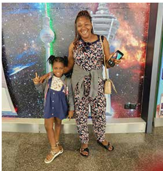
A mother and daughter moment inside the KL Tower