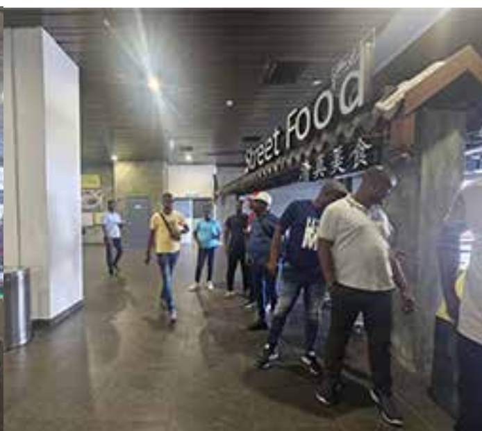
Participants inside the Genting Highlands