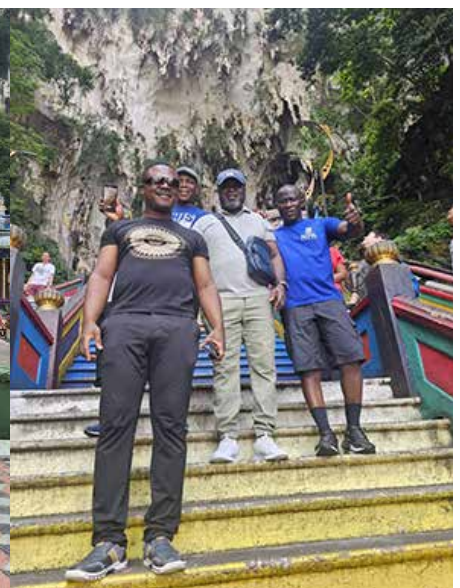
Some participants ascending the staircase to the Cave