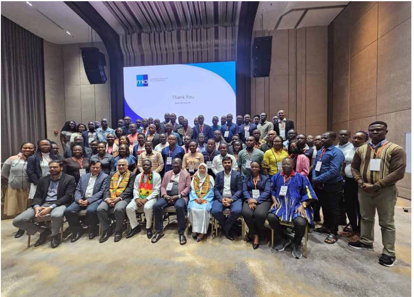
A group photograph after Day 1 seminar in Malaysia

Characterized by many insightful, knowledge-sharing, and fun-filled opportunities, the ICAG Boot Camp and International Tour in Malaysia, an exclusive 10-day program organised for Chartered Accountants was worth embarking on.