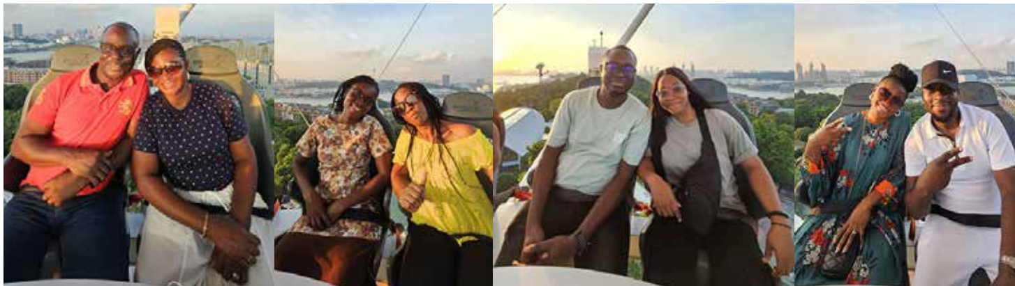
Cross-sections of participants having fun on the Singapore Flyer

It was tour time and participants had the opportunity to feast their eyes on breathtaking views including the Singapore Flyer and Time Capsule. Participants were also thrilled to see the world-renowned landmark in Singapore known for its iconic architecture, luxurious accommodations, and stunning rooftop infinity pool.