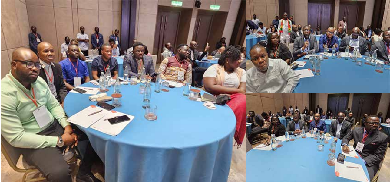
A cross-section of participants at the Boot Camp

This programme was initiated by ICAG in partnership with Global Wings Travel and Tours Ltd. last year as part of its 60th Anniversary Celebration which saw members travel to Mauritius and Dubai.