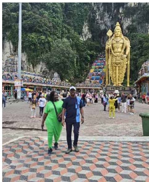
An establishing shot of the Hindu deity with some participants in the shot

Religion is an integral part of a people's culture and participants didn't miss out on it as they visited one of the nation's most beloved shrines, located in the Batu Caves. A flight of 272 steps leads up to the sacred Hindu temple cave where the shrine of the Hindu deity, Lord Murugah lies. Another cave, called the museum cave, is filled with images of deities and murals depicting scenes from the Hindu scriptures. It was also a good exercise for those who could climb the 272 staircase.