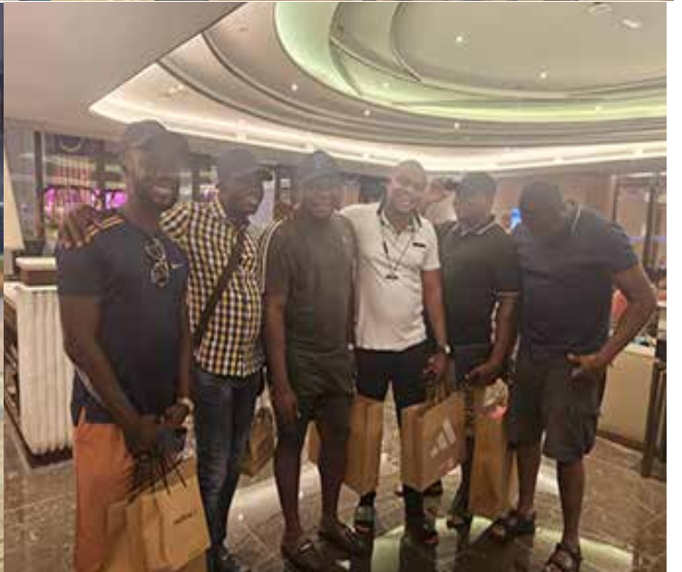
Cross-sections of participants shopping and having fun moments