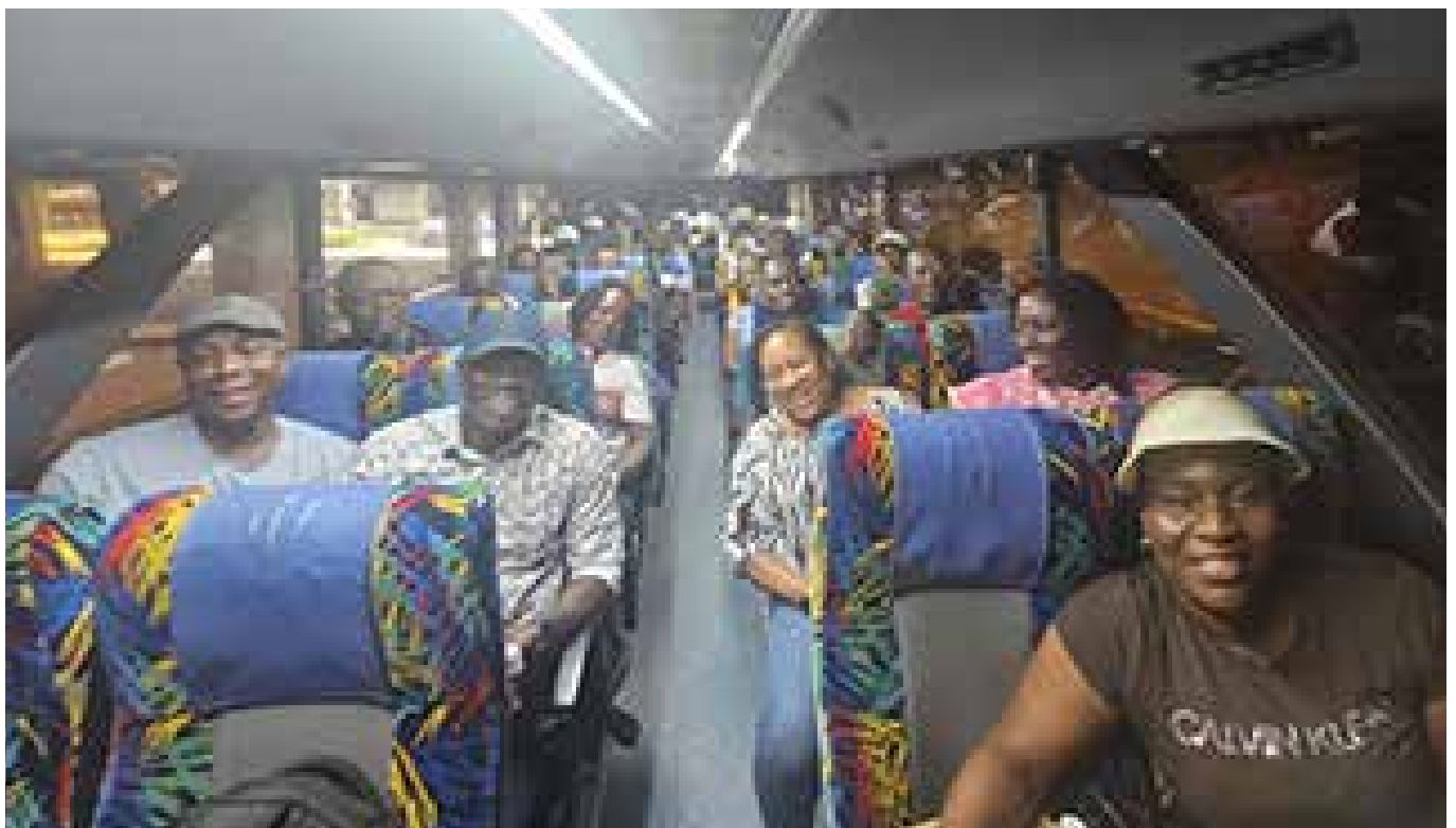
Participants en route to Singapore