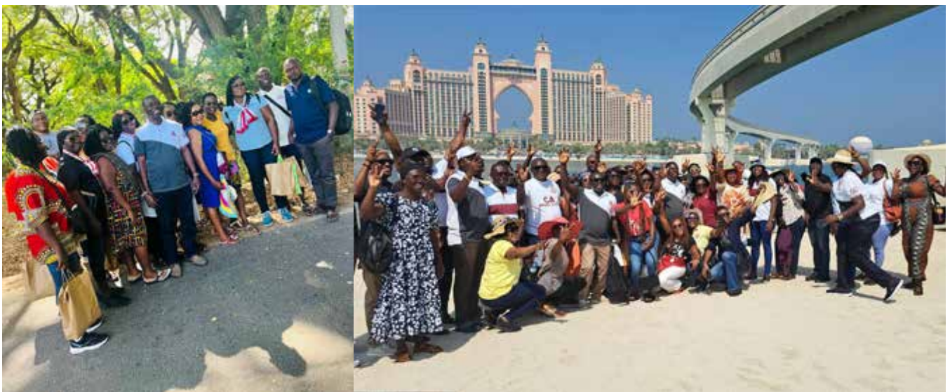
Group photographs from 2023 Boot Camp in Dubai and Mauritius

This programme was initiated by ICAG in partnership with Global Wings Travel and Tours Ltd. last year as part of its 60th Anniversary Celebration which saw members travel to Mauritius and Dubai.