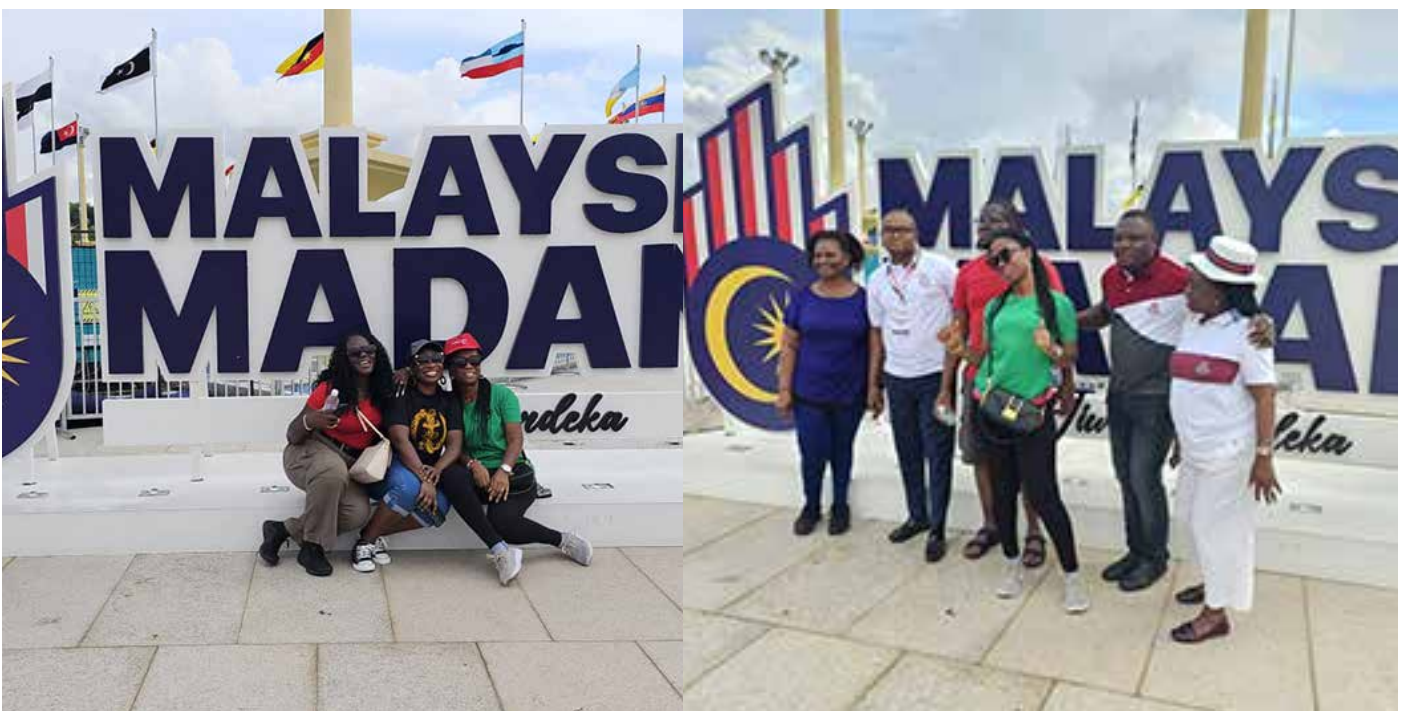
Out and about in Malaysia