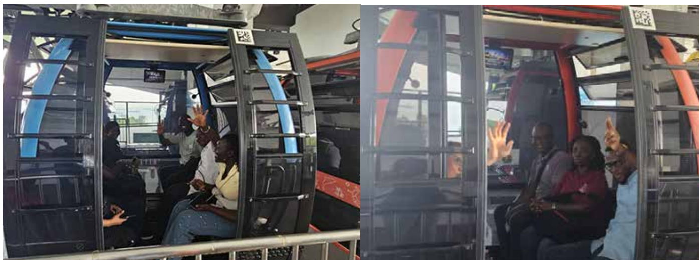
Cross-sections of participants in the cable cars about to take a ride