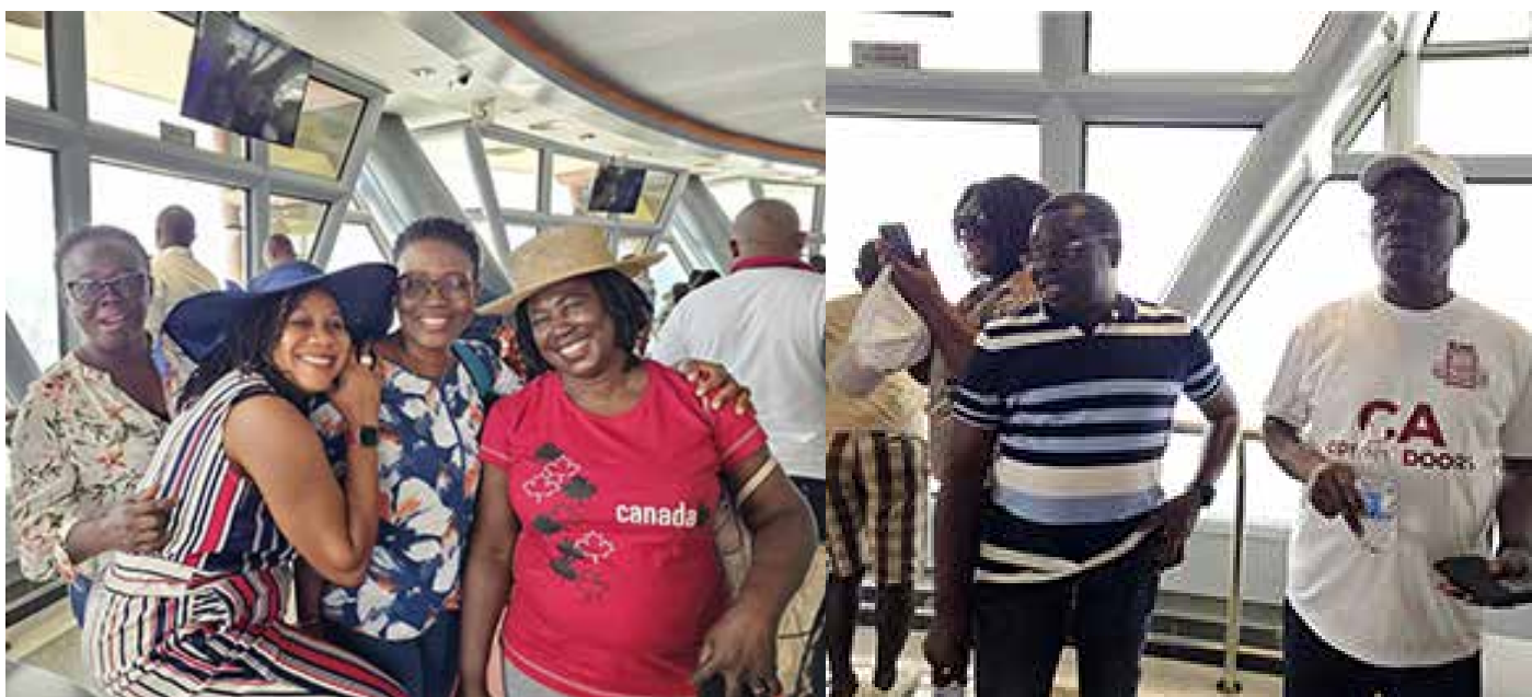
Fun moments inside the KL Tower